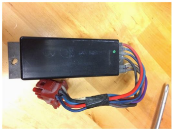
Original Countach Door Lock Relay Control

The original Factory Door relay is not only not available to order any longer but there are no diagrams. Kiekert made the door relay, which provides an automatic engagement whenever the door locks are engaged or disengaged. After a lot of research I found a control relay, that operates EXACTLY like the original produced by the same company that produced the door actuators. MES a Swiss company produces this control relay. I have mapped out the correct connections from the OEM harness to the new Lock Control Relay. I have noticed some variations with the plug orientation on the actuators. So if you attempt this Mod, be patient and map out the wires. I would suggest purchasing the Electric-Life basic 2 Door Central Control Kit (Two actuators and the control relay for < $90 USD