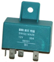
MES Door Lock Relay Control